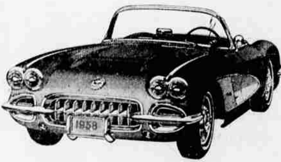
The distinctive Corvette for '58—dashing new sports car styling!

New 1958 Corvette America's only sports car is even sportier—with power to match its magnificent handling and road-holding ability. It offers a 4-speed manual shift* for expert drivers. *Optional at extra cost.