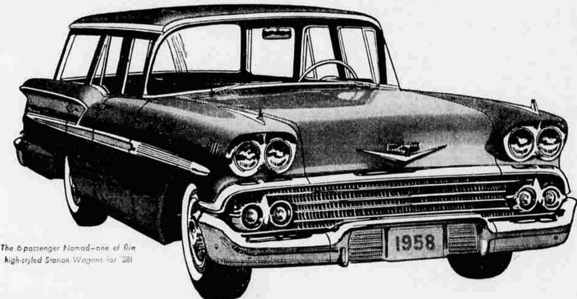
The 6-passenger Nomad—one of five high-styled Station Wagons for '58!

THE BEAUTIFUL WAY TO BE THRIFTY... '58 CHEVROLET!