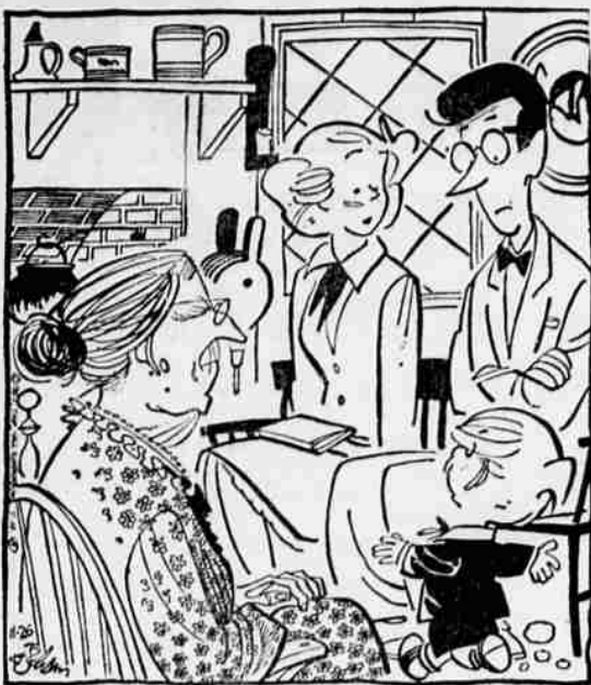
"SHE'S SURE GOT A CRAZY 'FRIGERATOR!' IT'S JUST GOT ONE GREAT BIG ICE CUBE IN IT!"