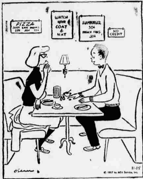
"I'll toss you for it—Dutch treat or nothing!"