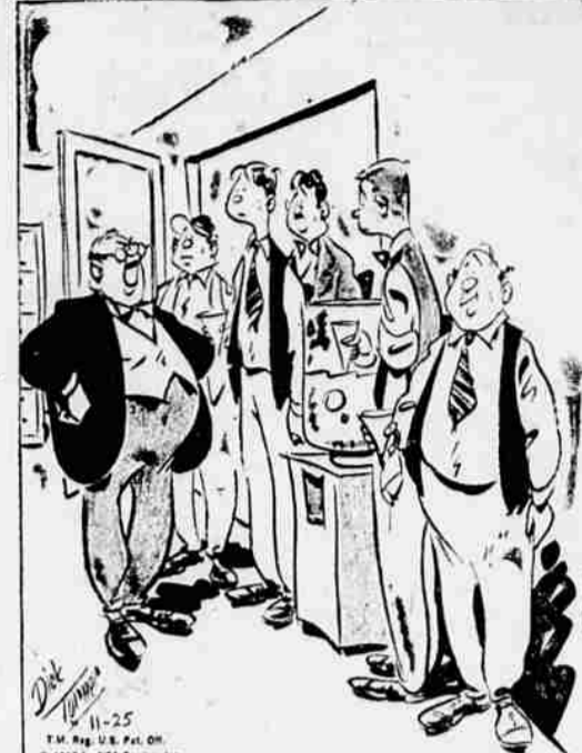
"Now then—let's try to mix in a little work with the conviviality, shall we?"

Group Greeted Wrong Plane: PORTLAND (AP)—A reception committee met the wrong plane Sunday night when a Finnish balerina came to Portland.