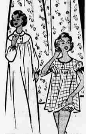
9127 SIZES 10-20 by Marian Martin

SWEET DREAMS Sweet for sleep—our Printed Pattern makes a complete slumber wardrobe—easiest sewing. Nightie comes in 3 lengths (with bloomers for shortie style), 2 necklines, 2 sleeve versions.