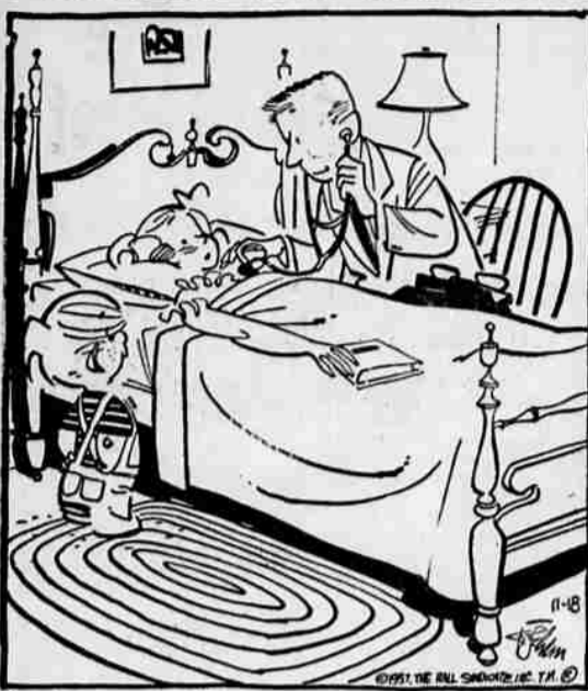
"DON'T WORRY, MOM, HE'S JUST CHECKIN' YOUR MOTOR."