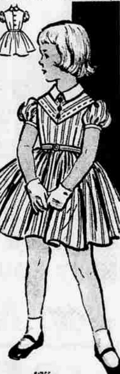
9194 SIZES 2-10 by Marian Martin

SMARTEST IN SCHOOL. Smartest member of the fashion class, the lucky little girl who wears this pert and pretty style! It has a pointed yoke in front, button trim and full gathered skirt. Sewing's easier with our Printed Pattern.