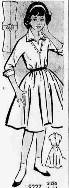
9227 SIZES 6-14 by Marian Martin

CINCH-TO-SEW! No waist seems to this smart 'n' simple sack dress — just cinch it with a belt! Mom, stitch up this Printed Pattern in a day — or let daughter make it with your help. She'll be so proud of herself. Make it now!