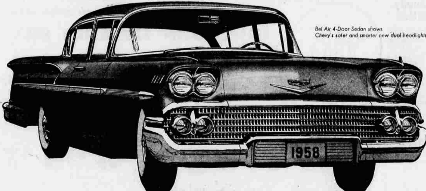
Bel Air 4-Door Sedan shows Chevy's safer and smarter new dual headlights.

Chevrolet takes the giant step with the biggest, boldest move any car ever made. New length, new looness, new width — stunning new shapes in glass and steel—a radical new V8—a wonder-working Full Coil suspension and real air ride—a brilliant new body-frame design! Never before has a car been so wonderfully new in so many different ways. See it now.