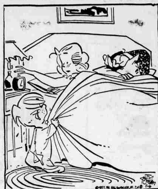
"I NEED ANOTHER BLANKET! SOME PEOPLE DON'T HAVE 'LECTRIC BLANKETS, YA KNOW!"