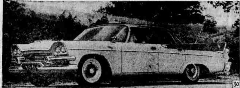
DODGE LANCER shown here is one of the 1958 Dodge models showing at Cunningham and Rickey. This is the custom royal four-door Lancer. A complete safety group including power steering, power brakes, padded dashboard and sun visors is included on all 1958 Dodge cars. Safety torsion-air ride is standard on all models, and the push-button torque-flite transmission is an added convenience.