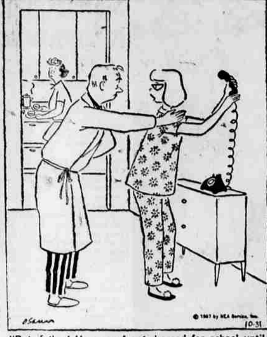
© 1957 by NEA Service, Inc. 10-31

"Nevertheless, this advantage of wedded bliss is also observed in the laboratory where white rats which have been mated appear to live longer. Indeed even the presence of an additional member of the same sex in a cage is generally considered favorable to longer life."