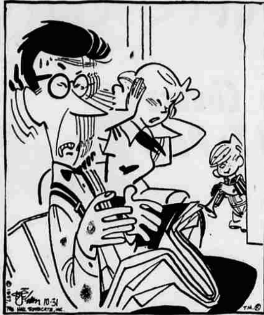
MEMBER WHEN ALL I COULD GET OUT OF THIS WAS A PEEP?