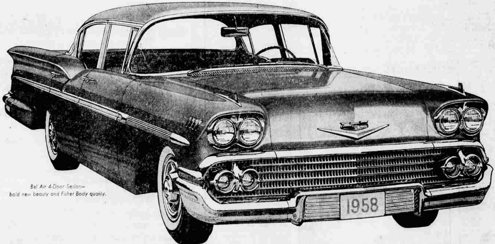
Bel Air 4-Door Sedan—bold new beauty and Fisher Body quality.

Only franchised Chevrolet dealers display this famous trademark See Your Local Authorized Chevrolet Dealer