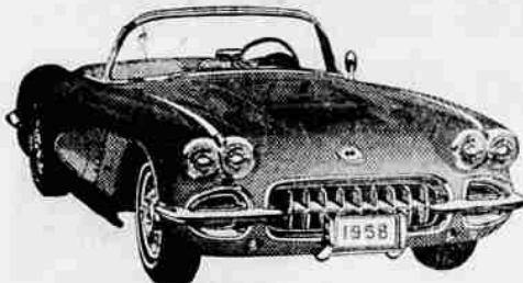
New '58 Chevrolet Corvette—America's only sports car goes even sportier!

Meet the beautifully moving '58 Chevrolet... panther-quick, silk-smooth! It brings a V8 unlike any other. Full Coil suspension, a real air ride and even two new super models! See it tomorrow!