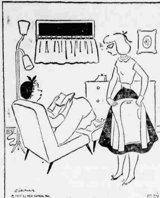
"I'm not going out on any more double dates—there's always another girl along to spoil things!"