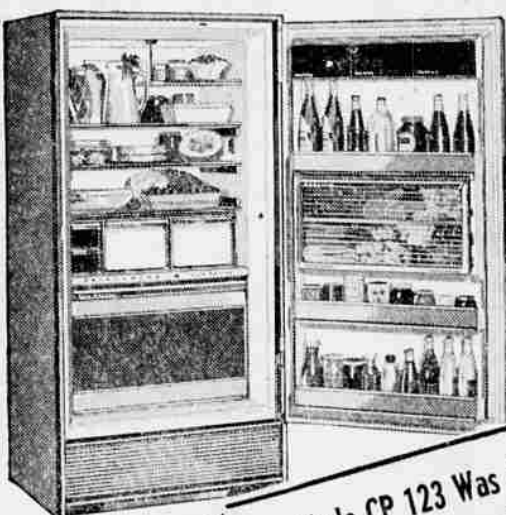
"COLD PANTRY" MODEL, Freezer below. 12.3 cu. ft. Holds 94 lbs. of frozen foods. Self Defrosting!

This is it! The last of the '57 models at the lowest prices you'll ever see on Frigidaires. We bought a half car of the last models available and we're passing the savings on to you! Buy now . . . you'll never get better appliances for less!