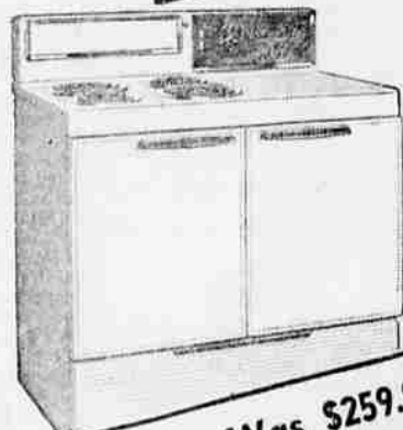
FRIGIDAIRE Model RS - 15 RANGE

Was $249.95 Now $199.95 $25 Copco Bonus in addition to our own generous trade-in allowance!