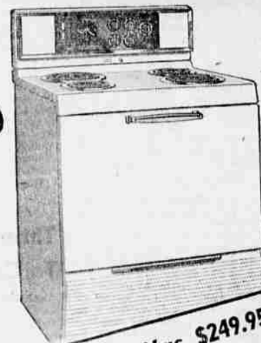
FRIGIDAIRE Thrifty 30 RANGE Model RS-38

$25 Additional COPCO Bonus!! Take advantage of the extra $25 Copco Bonus now! It's in addition to our regular big trade-in allowances and you can really get your range or new hot water heater at rock-bottom! But . . . act NOW!