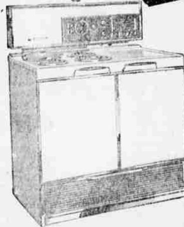
SAVE $100.00 FRIGIDAIRE IMPERIAL RANGE Model RI "70" - The range that has everything! Was $549.95 now $449.95

Was $259.95 Now $219.95 $25 Copco Bonus allowance in addition to our own trade-in allowance!