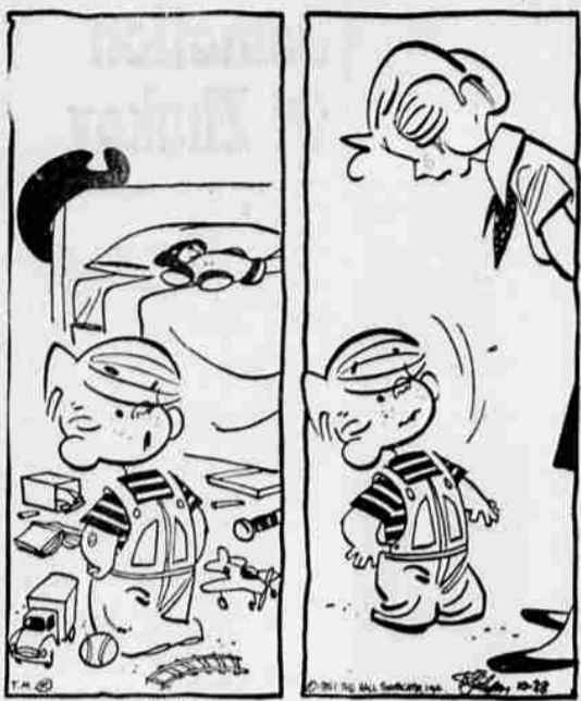
*WHO SAYS IT'S MY BEDTIME? * YOU, HUH? *