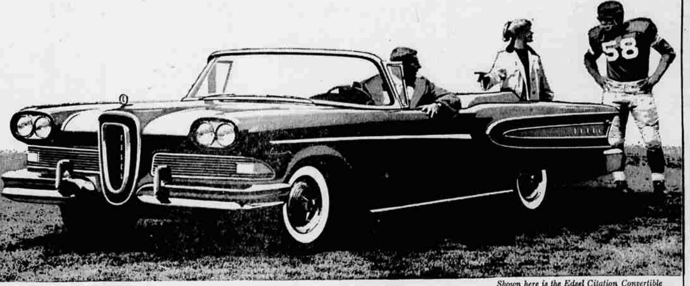
Shown here is the Edsel Citation Convertible

"It acts the way it looks, but it doesn't cost that much"