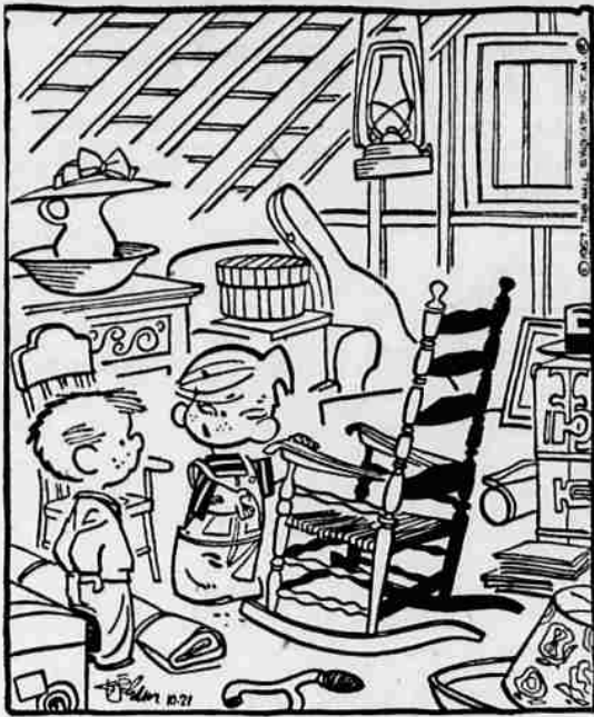
"YOU'RE CRAZY! THIS ISN'T OLD FASHIONED! THIS IS A ROCK 'N ROLL CHAIR!"