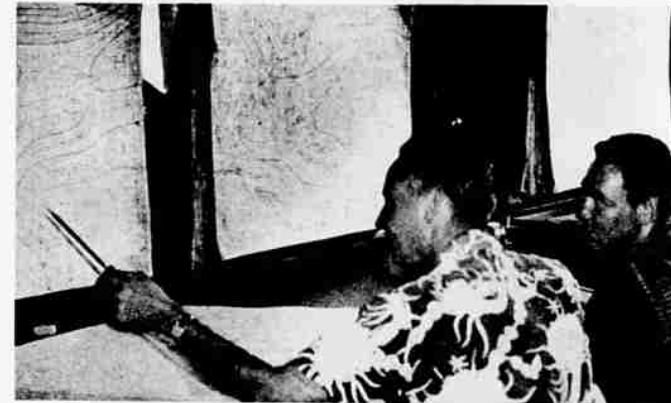
Weather experts study charts and maps in search for secret of storms.