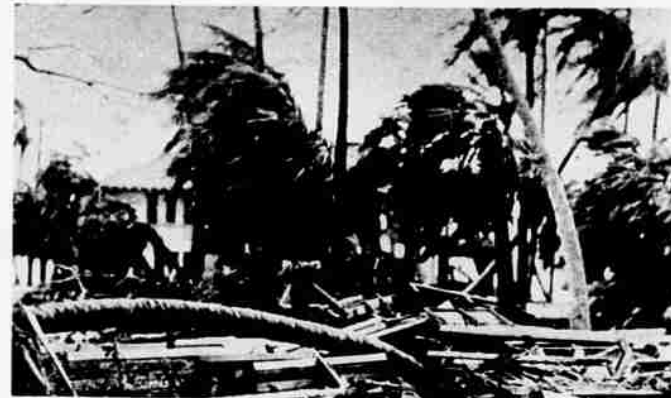
Unless secret is found, havoc of hurricanes will continue to plague coasts.