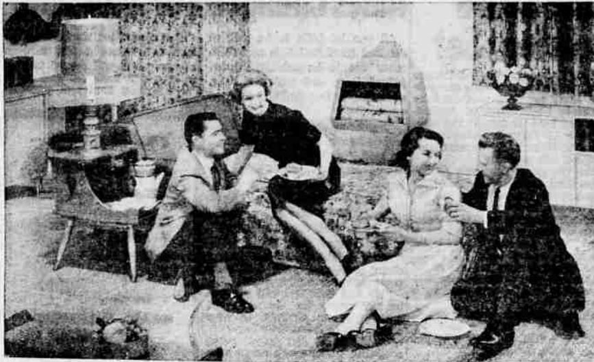
SMALL ROOM SOFA hides a twin-bed size mattress which can be used as a guest bed or, as shown above, covered with a decorative spread to provide extra seating. Storage chests are painted pale gray to match the walls.