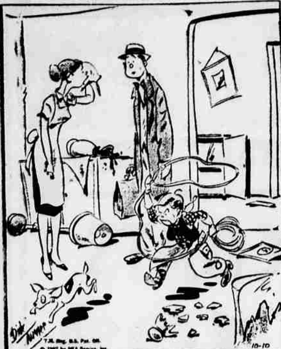
"Maybe we could get help from the government! Surely this could qualify as a disaster area!"