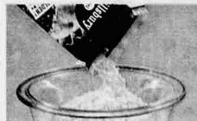
GOLDEN IN THE PACKAGE!

Ten full ounces in every package—plenty for a real man-size two-crust pie. No more troublesome patching, stretching or running out of dough! Bake your next one golden—and make it soon!