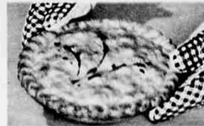
GOLDEN IN THE CRUST!