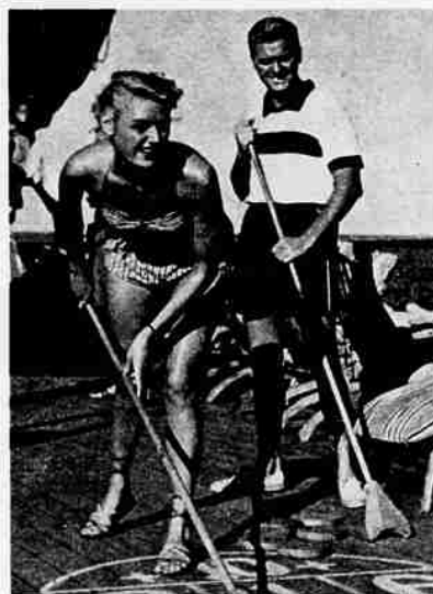
Shipboard fun, then new adventures in port.

If you're interested in buying foreign goods such as lace, leather, antiques, or photographic equipment, check to make sure your cruise will stop in a free port where prices are lowest.