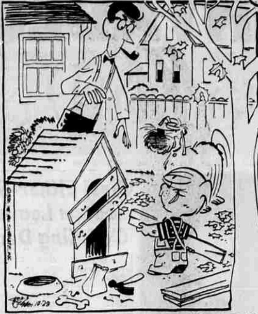
WE'RE CLOSIN' IT UP FOR THE WINTER. RUFFUS GONNA MOVE IN WITH US!

California Weather SAN FRANCISCO (UP) — Five-day weather forecast for Northern California: Rain at times during week with moderate amounts near Oregon border; temperatures below normal; normal minimum-maximum Sacramento 46-73, Red Bluff 50-74, Eureka 48-59, Blue Canyon 42-57, Santa Rosa 41-73.