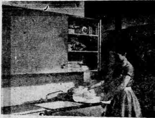
THIS IS A CABINET which could be installed almost anywhere but it seems to lend itself unusually well to a laundry area where a variety of materials must be stored. The design is simplicity itself and can be altered to fit individual needs of a particular room. The overhead cabinet can be turned out by an amateur in just a few evenings.