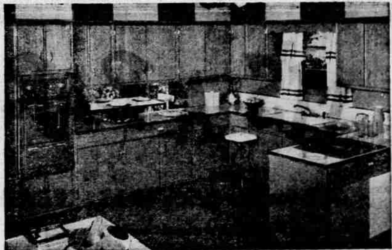
BUILT-IN COOKING UNITS flank richly grained wood cabinets in a kitchen that is as modern as today's newspaper. The oven at left fits at the correct height for the homemaker in a factory-produced wood cabinet with storage space above and below. It is adjacent to counter top work space and a passage way to the dining room beyond. Both cabinets and appliances are easy to maintain and offer the utmost in beauty and efficiency so much in demand in today's kitchens.