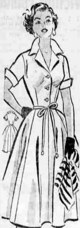
9238 12-20 30-42 by Marian Martin

Five days out of seven, this is the dress you'll reach for! It's easy to sew—jiffy to iron—always looks crisp and fresh! Make it all one color, or have the top and skirt contrast for a smart new separates effect. Choose laille, winter-cotton, textured rayons. Pattern 9238. Misses' Sizes 12, 14, 16, 18, 20, 22, 24, 26, 28, 30, 32. Size 16 takes 4 1/2 yards 39-inch. This easy-to-use pattern gives perfect fit. Complete, illustrated Sew Chart shows you every step. Send thirty-five cents in coins for this pattern—add 5 cents for each pattern for 1st-class mailing. Send to Marian Martin, care of Herald and News, Pattern Dept., 232 West 10th St., New York 11, N.Y. Print plainly name, address with zone, size and style number.