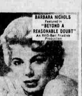
BARBARA NICHOLS featured in "BEYOND A REASONABLE DOUBT" An MGD Production