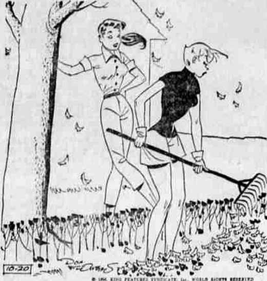
"You can't have the summer shade without the autumn leaves."