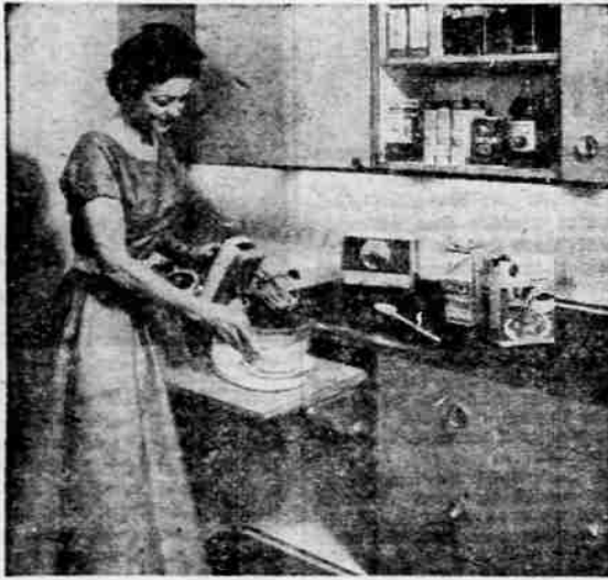
HERE IS ANOTHER helpful kitchen companion for the housewife; a well planned mixing center cabinet which contains space enough for all the regular ingredients for most any type of recipe. Conveniently stationed above it could be a sliding spice rack, the right combination for say, a tasty cake.