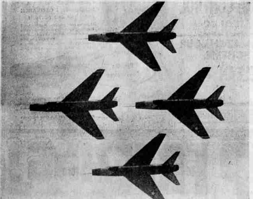
PRECISION FORMATION FLYING was demonstrated by the "Thunderbirds," a team of U.S. Air Force pilots who staged a magnificent show at the Aerial Firepower Demonstration at Eglin Air Force Base, Florida, Sunday, October 7. In June of 1956, the "Thunderbirds" became the first world's supersonic aerobatic team when they were equipped with the North American F-100 Super Sabre shown here.

alizing that the U.S. cannot afford the luxury of trial and error methods, the Air Proving Ground Command has replaced this costly system with "Proof by Test."