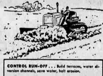
CONTROL RUN-OFF ... Build terraces, water diversion channels, save water, halt erosion.

The yield capacity of your farm can be economically increased by the extra usefulness, economy and work capacity of a Caterpillar Diesel Tractor. Illustrated here are only a few of many ways a Cat track-type Tractor will serve you. We invite you to discuss these points with our specialists, compare our products and services. Then you be the judge!