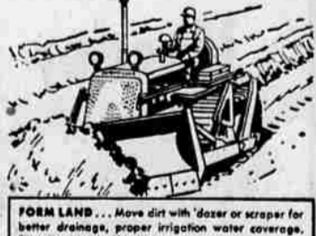
FORM LAND ... Move dirt with dozer or scraper for better drainage, proper irrigation water coverage. Fill gullies, take off high spots.