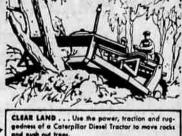
CLEAR LAND ... Use the power, traction and ruggedness of a Caterpillar Diesel Tractor to move rocks and push out trees.