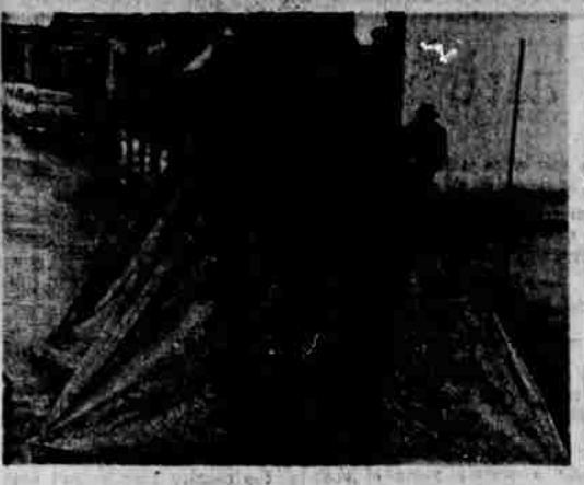
WHAT'S THIS, ANOTHER URANIUM STRIKE in the vicinity of Eleventh and Main? Not hardly, below this tent are some of the telephone company boys doing a little underground cable work in the rain Thursday. By late morning they had filed no mining claims involving the intersection.

More clashes are expected, probably Saturday. The additional land is needed to extend the runways so they can take big jets.