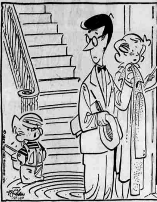
"HOW 'BOUT ME? I HAD A TOUGH DAY IN THE BACK YARD!"