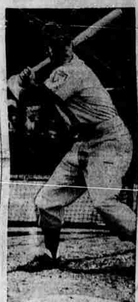
MICKEY MANTLE ... socks home run

YANKEES FOURTH Robinson threw out Bauer. Collins was called out, the third strike curving over the outside corner. Mickey Mantle slammed his third home run of the series just inside the foul pole into the lower right field stands. It was his eighth homer in series competition. It was also the first hit by either side in this game. Berra lined to Snider who made a spectacular diving catch at his shoe tops. One run, one hit, no errors, none left.