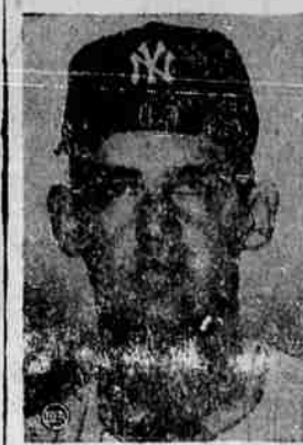
DON LARSEN ... hurls perfect game