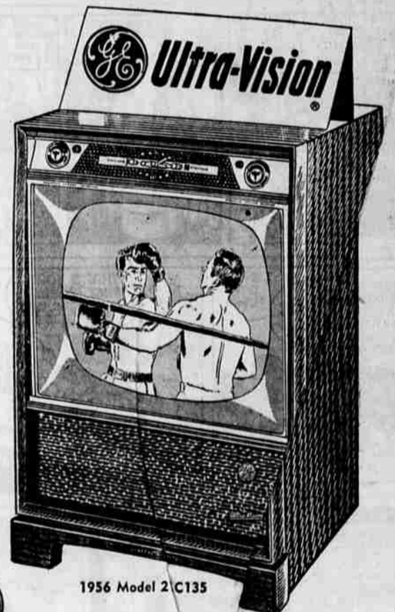
1956 Model 21C135

Turns on your favorite program anytime — automatically! Packed with famous G-E quality features including aluminized 90-degree picture tube for biggest picture and shallower cabinet. Concealed swivel-casters . . . Genuine Mahogany . . . A Top-Of-The-Line Model at a Bargain Price!