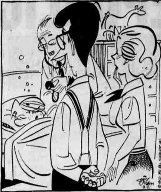
"HOW COME THAT OL' PIPE DON'T MAKE YOU SICK?"