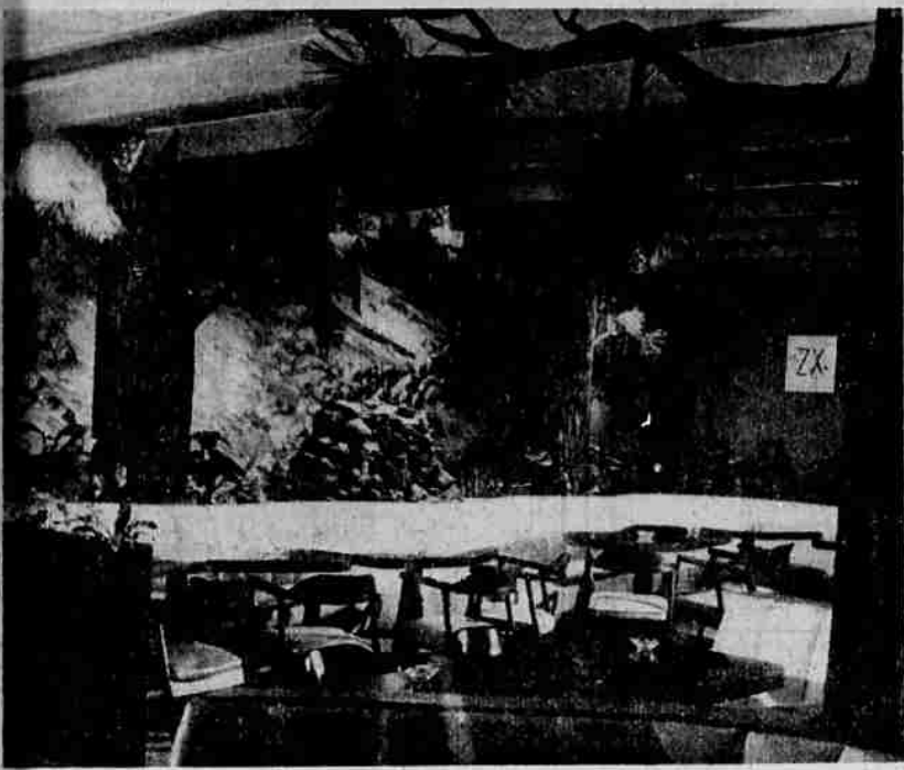
YOU DON'T RECOGNIZE THIS PLACE? . . . well that's altogether understandable because it's a portion of the completely remodeled and redecorated Ponderosa Room in the Willard Hotel. Being in full accord with the Ponderosa theme, the interior is complete with artificial trees and new murals depicting familiar mountain scenes. All new fixtures have been custom built for the room, and the dancing area has been enlarged. Manager Marvin Brown points out that a broiler-type food server has been installed and that steaks will be served on thermo-plates. A luncheon counter is also expected to be in operation by the latter part of this week.