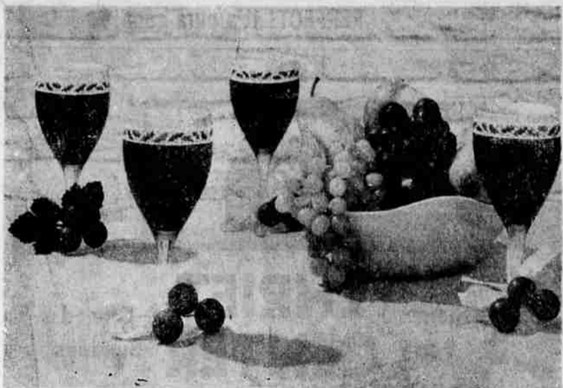
GRACEFUL GOBLETS filled with homemade jelly make a handsome holiday gift and one that is sure to be well received by many on your list. Make yours now while grapes are at their best.