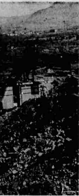
Two injured in tanker explosion

FORECAST—Klamath Falls and vicinity: Partly clearing Friday night and Saturday. Highs 45-54; lows Friday night 26-32. High yesterday 52 Low last night 36 Precip. last 24 hours 17.31 Precip. since Oct. 1 17.31 Same period last year 5.05 Normal for period 9.42