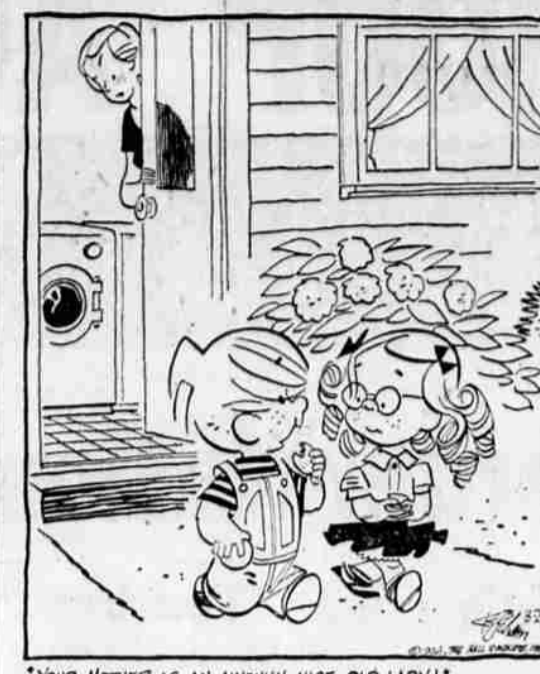
"YOUR MOTHER IS AN AWFULLY NICE OLD LADY!"