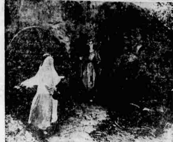
MAGDALENE at the tomb is a dramatic scene from "Oberammergau and the Passion Play," a full length film in natural color to be shown at the Mills School Auditorium Wednesday, March 21, under the sponsorship of the Klamath Falls Lions Club. There will be a 4 o'clock matinee and an 8 o'clock evening show.