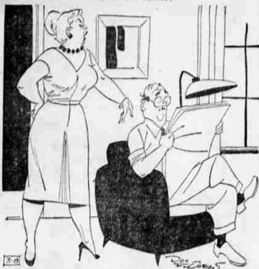
"I'd make a perfect first lady. But you're just not presidential timber!"