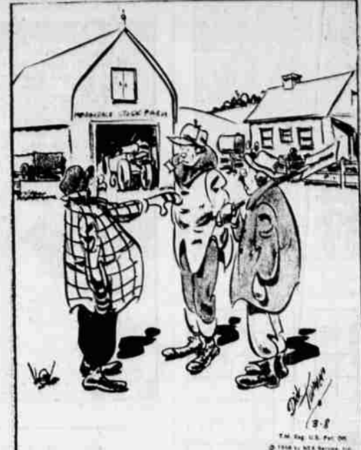
"Hank, you fix the fence behind the drive-in theater! George, you fix them hog houses in the pasture over by the shopping center!"