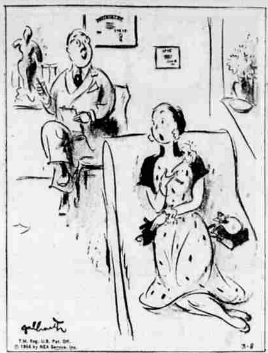
"There's nothing the matter with me—I just came to see if you can figure out what's wrong with my husband!"