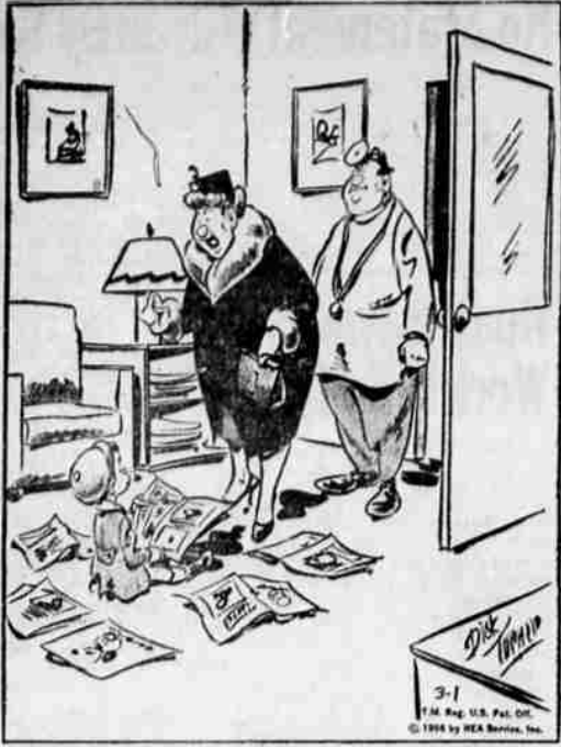
"Now then, Cyril! Tell Dr. Quack—er—Dr. Simpkins, you're sorry to have mussed up his waiting room!"