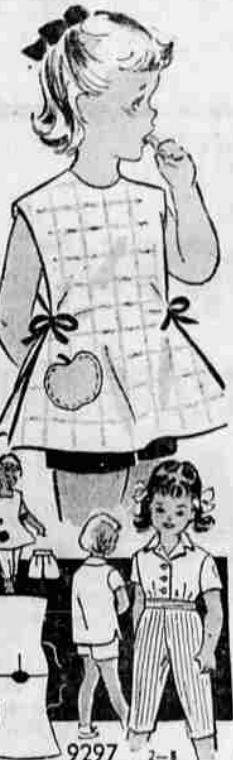
9297 2-1 by Marian Martin

Everything in this easy-sew separates wardrobe to keep her playing happily all summer! Jac-shirt, pedal pushers, shorts—even a gay poncho with "apple" for its pocket! Mix and match styles for every day of the week! Pattern 9297: Child's Sizes 2, 4, 6, 8. Size 6 poncho, 1 1/2 yards 25-inch; shorts, 3/4 yard. Other yardage requirements in pattern. This easy-to-use pattern gives perfect fit. Complete, illustrated Sew Chart shows you every step. Send thirty-five cents in coins for this pattern—add 5 cents for each pattern for 1st-class mailing. Send to Marian Martin, care of Herald and News, Pattern Dept., 232 West 18th St., New York 11, N.Y. Print plainly name, address with zone, size and style number.