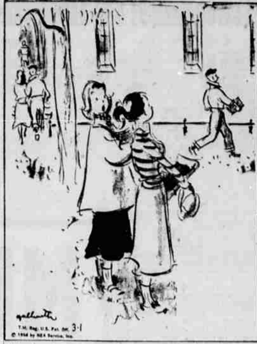
"Jessica dated him and said he tried to kiss her, but you know how Jessica boasts—every boy she goes out with is a terrible wolf!"

KUSHIRO, Japan (AP) — A pre-dawn fire swept through a congested amusement area Wednesday, leveling three theaters and 15 other buildings. One body was recovered and one person was missing. Three others who jumped from flaming roofs were hospitalized.