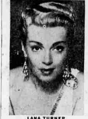
LANA TURNER Co-Starring in M.G.M.'s "DIANE" In CinemaScope and Color

coed who, while in a trance, refused to pick up $100,000 on the show last fall.