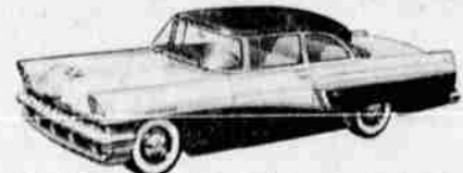
*2-Door 4-Passenger Sedan. Price includes Flo-Tone paint, white sidewall tires. Other optional equipment, accessories, price and local taxes, if any, additional. Prices may vary slightly in adjoining communities.

Only $2525 00 BUYS THIS BIG 1956 MERCURY MEDALIST