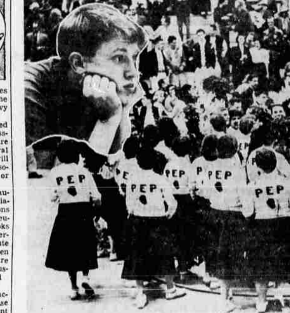
KLAMATH FALLS rooters swarmed in a masse around the KUHS Pelicans Friday night at Medford after the Pels won, 65-57, league game from Medford High. Members of the KU pep squad mob Klamath players, but the story was different for Medford fans. Upper left, an unidentified Medford band member shows no signs of hope as the time runs out on his prep heroes.