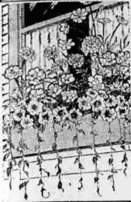
A window box should decorate the house.

Glamorine For WOOL or COTTON RUG CLEANING Goeller's 322 Main