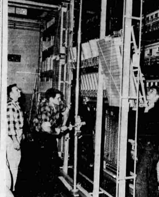
NEW EQUIPMENT is being installed at the Klamath Falls office of the Pacific Telephone and Telegraph Company to tie this area into the nation-wide long distance dialing setup.

The potato market as reported Friday by the U. S. Department of Agriculture: Arrivals 252; on track 828; shipments 829; Northern Calif. 17, Central Calif. 2, Idaho 206, Oregon 26, Washington 14, Russells No. 1-A, 10-20 per cent 10 oz and larger 3.00-3.10; 20-30 per cent 10 oz and larger 3.10-3.20; 30 per cent 10 oz and larger 3.20-3.25.