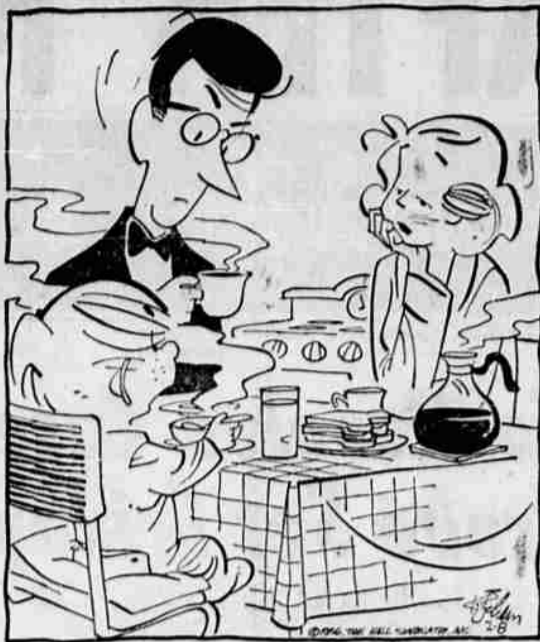
"I WISH DADDY WOULD HURRY AND GO TO WORK SO YOU AN' ME CAN GO BACK TO BED AGAIN!"